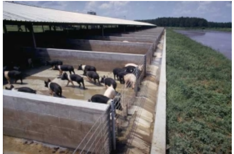
Hog parlor with lagoon

A lagoon should be constructed with a low-permeability liner made of synthetic material or geotextiles or formed by compacted clay or other soil material. Once the liner is established, it is imperative to maintain its integrity during the waste removal process. Any erosion can lead to seepage and subsequent contamination of ground water. Two practices to protect the liner are building a concrete access ramp for waste removal equipment, and operating equipment under dry conditions by first removing all the liquids and letting the solids dry.