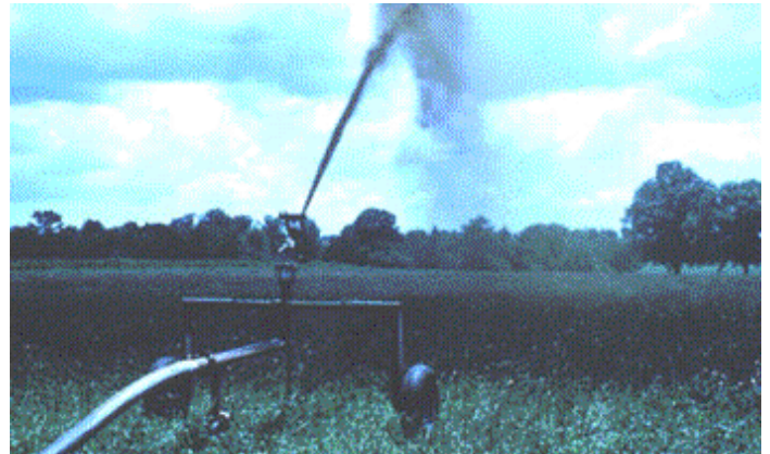
Animal waste used as fertilizer

Effective nutrient management minimizes the quantity of nutrients available for loss. This is achieved by developing a comprehensive nutrient management plan and using only the types and amounts of nutrients necessary to produce the crop, applying nutrients at the proper times and with appropriate methods, implementing additional farming practices to reduce nutrient losses, and following proper procedures for fertilizer storage and handling.